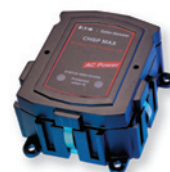
Whole Home Protection